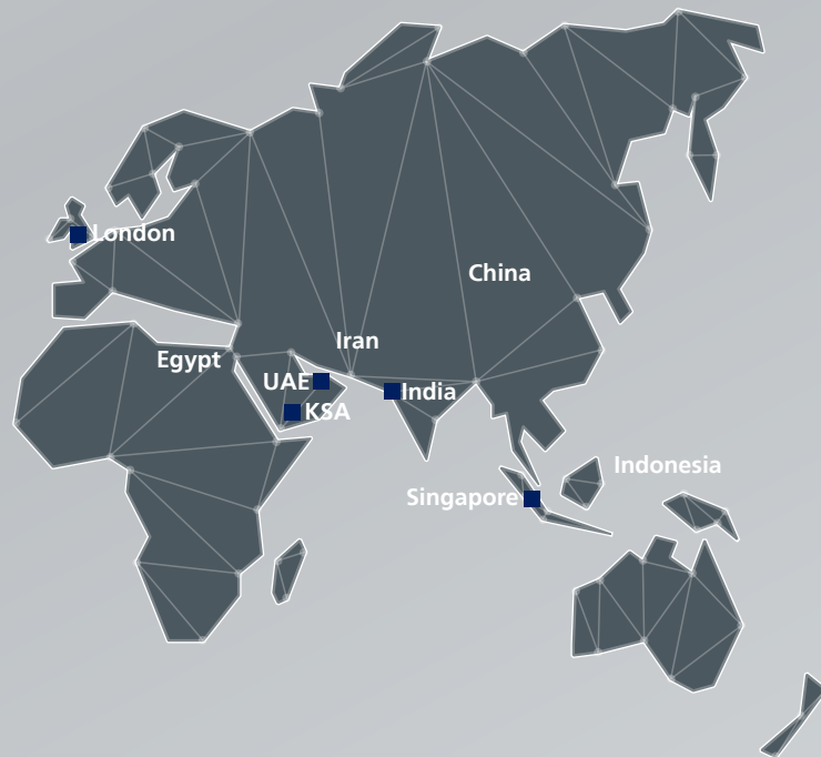
■ Private Banking Centres

Emirates NBD is one of the largest financial institutions in the GCC and the flagship bank of Dubai (56% government-owned.) It is comprised of full-fledged and diversified offerings across Retail Banking, Wealth Management, Wholesale Banking & Trade Finance, Islamic as well as Investment Banking.